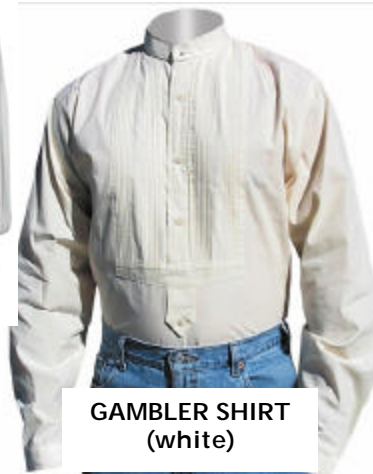
GAMBLER SHIRT (white)