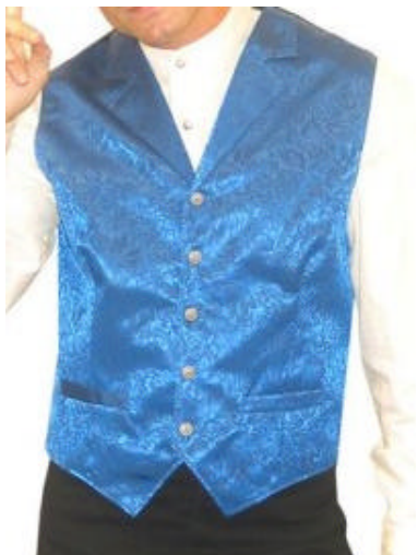
TWIN CITY VEST— WORN WITH OR WITHOUT A COAT (blue, red, silver)