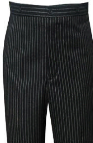
HENDERSON PANTS – pin-striped (optional)