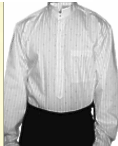
WYATT SHIRT (has black stripe design)

FROM SACINO'S 4213 W. Kennedy Blvd., Tampa. 289-5558 Tuxedo Pants: (non-adjustable) $21.95 - (adjustable) $29.95 Wing-tip collar shirts: $16.95 Western string-tie: $9.95 Crossover tie: $7.95 Cravat: $34.00 You may have more luck finding these ties online. Search! Long gambler-style coat: $110.00 (new) Short gambler-style western jacket: $50.00 Dice cufflinks & studs (optional & if available): starting at $25.00