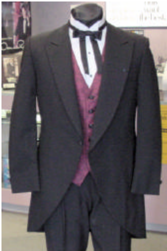
LONG GAMBLER COAT