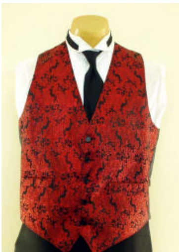
FULL-BACK METALLIC VEST— WORN WITH OR WITHOUT A COAT (red, purple, silver, gold)