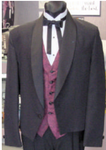
SHORT GAMBLER COAT