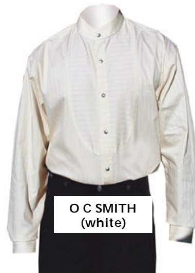
O C SMITH (white)

FROM RUSSELL'S WESTERN WEAR, 6027 N. Dale Mabry, Tampa or ONLINE where you can find them—Search for "gambler-style" hat: approximately $20.00 - $40.00 "GAMBLER" STYLE HATS MUST BE WORN. NO "COWBOY" HATS!