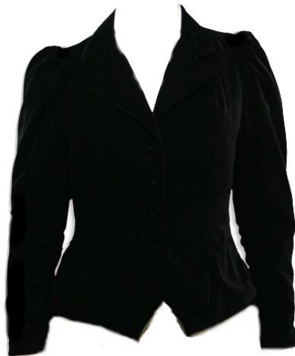
VELVET OUTING JACKET (Black)