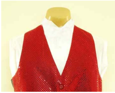
SEQUINED VEST (red, gold, turquoise, fuschia, royal blue, silver, burgundy & emerald green)

You must wear a "Gambler-Style" hat with this costume. No other headpieces are to be worn with the "Gambler" costume. Vests come in lots of great colors – Black Vests are never an option.