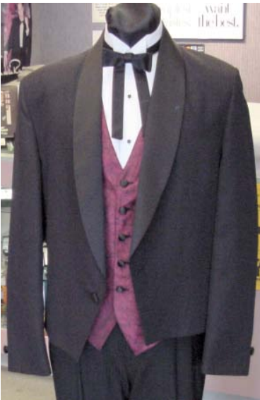
1 BUTTON SHAWL LAPEL ETON JACKET (Worn only with Gambler costume)