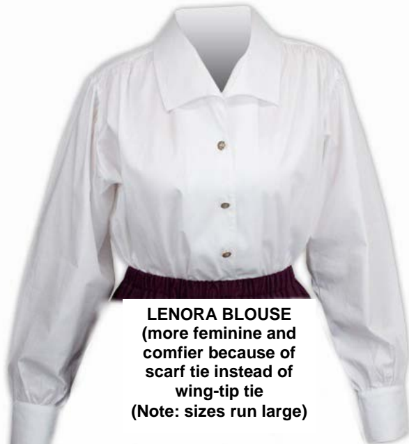
LENORA BLOUSE (more feminine and comfier because of scarf tie instead of wing-tip tie (Note: sizes run large)