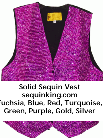
Solid Sequin Vest sequinking.com Fuchsia, Blue, Red, Turquoise, Green, Purple, Gold, Silver