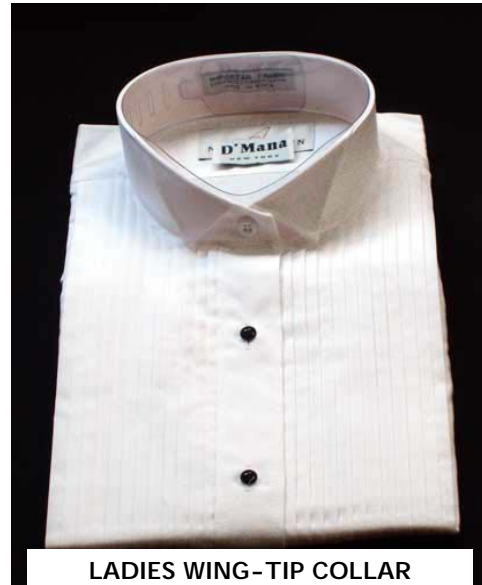
LADIES WING-TIP COLLAR TUX SHIRT (white)

Tuxedo Pants: $17.95+ www.uniformalwearhouse.com/apages/womenstux_pnts.html (or wear your own black dress pants – no jeans )