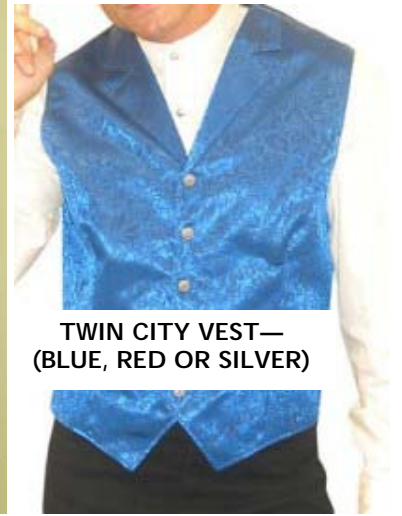
TWIN CITY VEST— (BLUE, RED OR SILVER)