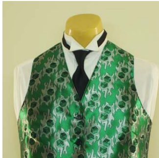
FLAMING DICE VEST (only green available)