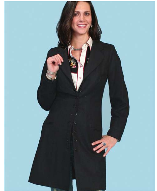
LADIES' WOOL VINTAGE FROCK COAT (worn only with Gambler costume)