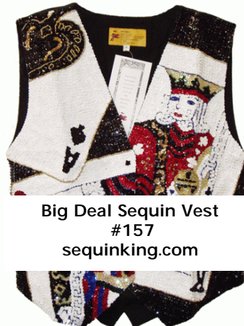
Big Deal Sequin Vest #157 sequinking.com

ALL VESTS ARE TO BE WORN WITH BLACK DRESS PANTS OR BLACK SKIRT & KENTUCKY TIE OR CROSS TIE OR LONG SCARF TIE (w/ Lenora Blouse) NO BOW TIES!