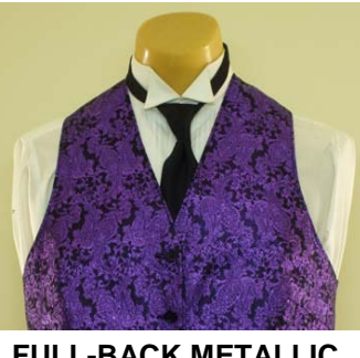
FULL-BACK METALLIC PAISLEY VEST (purple, red, gold)