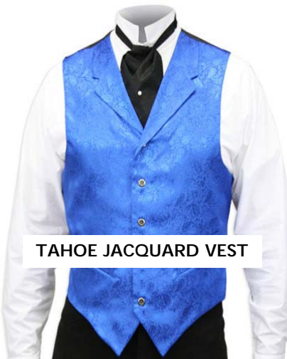
TAHOE JACQUARD VEST