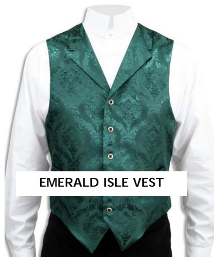
EMERALD ISLE VEST