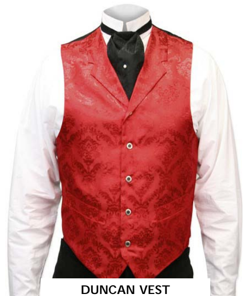
DUNCAN VEST WORN W/ OR W/O COAT