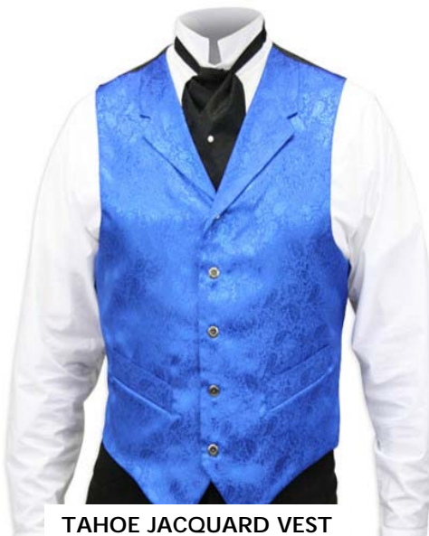
TAHOE JACQUARD VEST WORN W/ OR W/O COAT