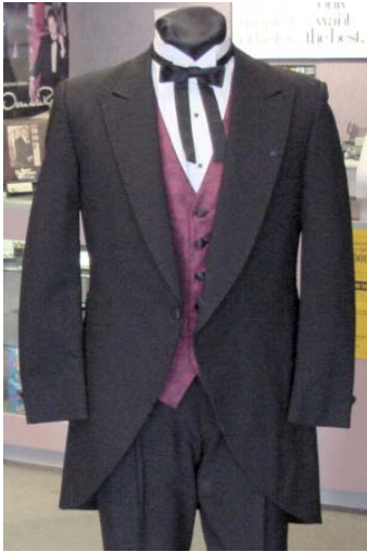
LONG CUTAWAY JACKET