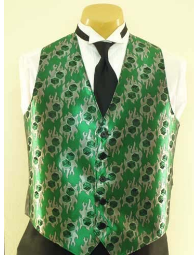
FLAMING DICE VEST WORN W/ OR W/O COAT (only green is available)