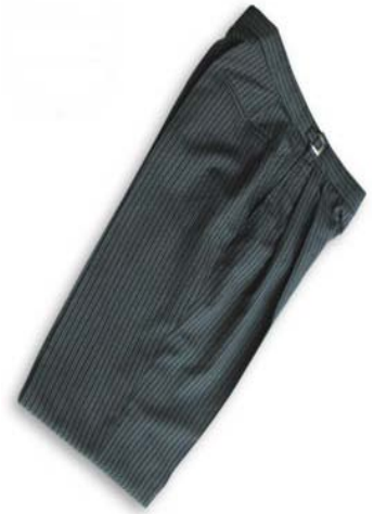
HICKORY STRIPE TROUSERS