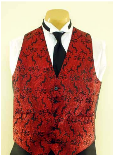
FULL-BACK METALLIC VEST WORN W/ OR W/O COAT (red, purple, silver, gold)