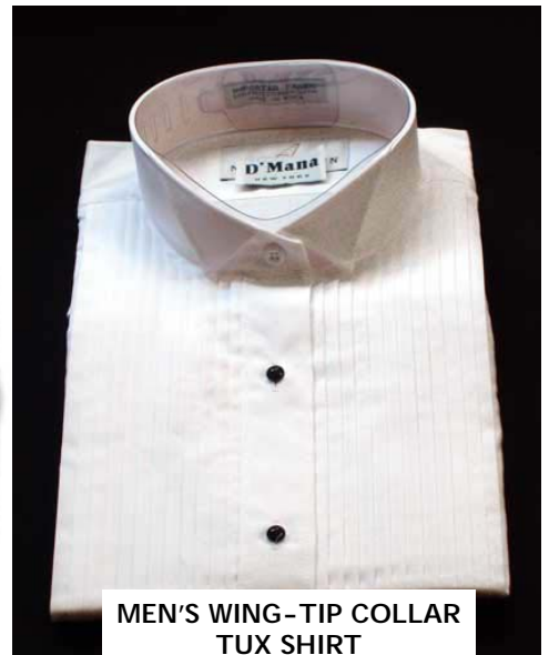
MEN'S WING-TIP COLLAR TUX SHIRT (white)