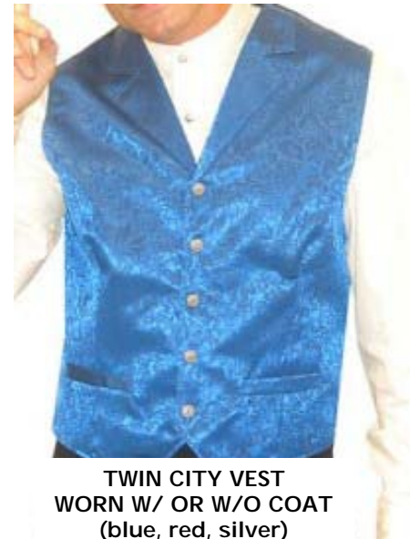
TWIN CITY VEST WORN W/ OR W/O COAT (blue, red, silver)