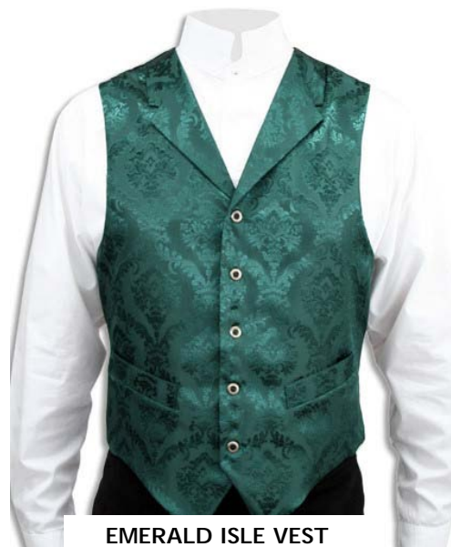
EMERALD ISLE VEST WORN W/ OR W/O COAT