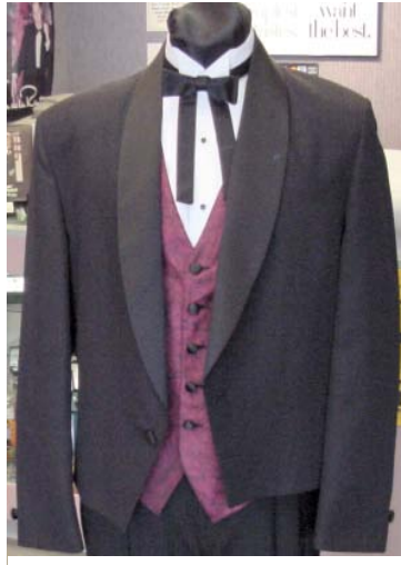
1 BUTTON ETON JACKET